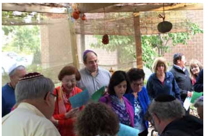
In the sukkah