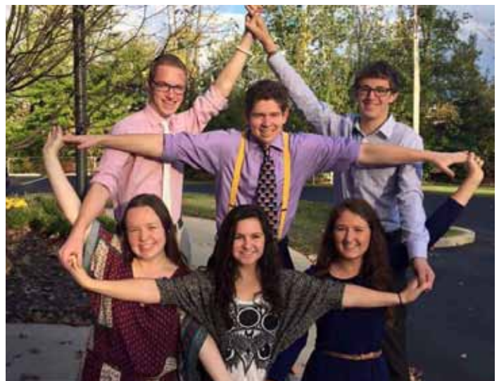
BITUSY Fall Board