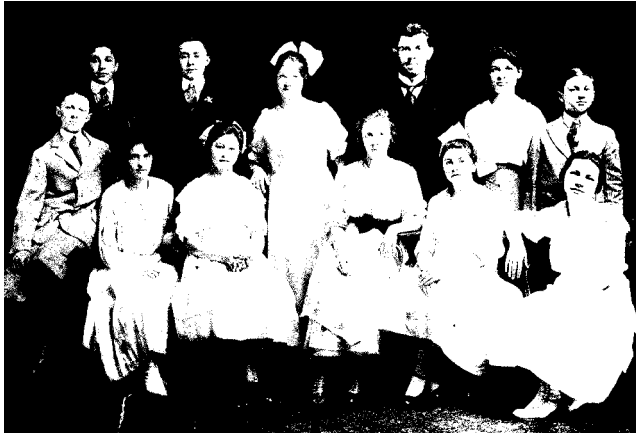
1916 Confirmation Class